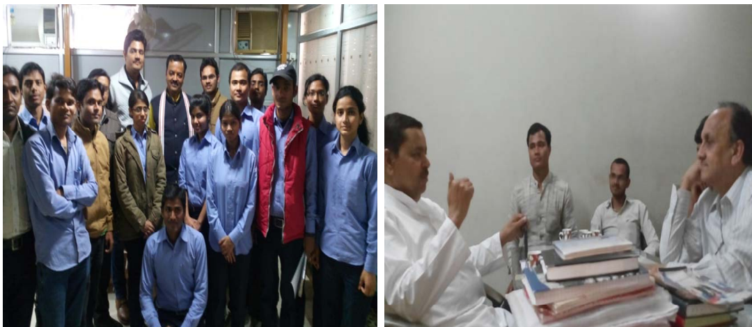
Meeting with M.P. Shri Keshav Prasad Maurya and MLA Shri Said Ahmed