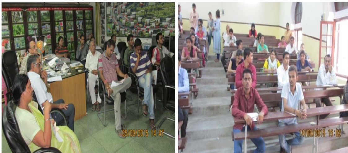
Press conference on starting of RT&D; Entrance exam for admission in M.Sc. RT&D