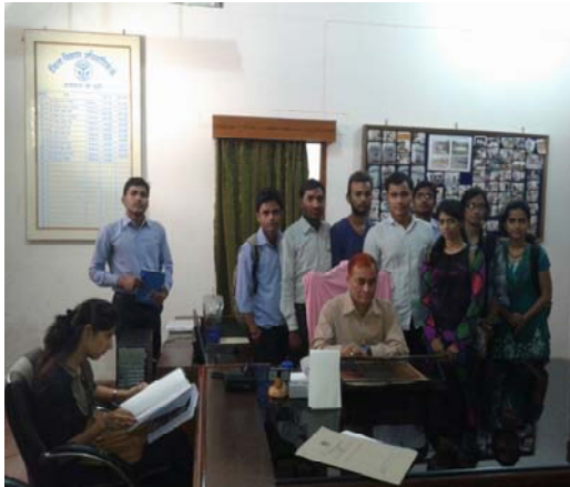
In Vikash Bhawan;