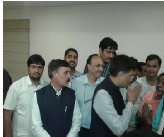
With Sri Piyush Goel, Coal and Energy Minister